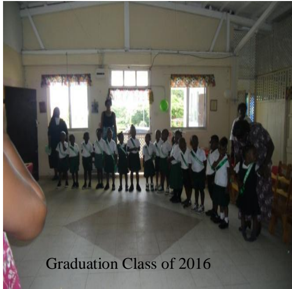
Graduation Class of 2016