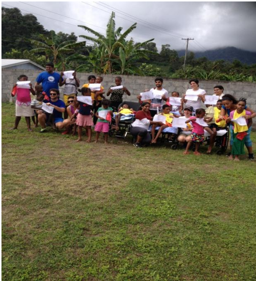
Medical Students and Children

Many visitors, took time off to visit the children - They enjoyed games in St. Benedict Park, adopting a child for the duration of the visit, shared snacks - to the children's delight. Many of the medical students and groups engaged the children in art and craft, tie dying, socialization. We thank them sincerely for their kind assistance. We are already looking forward to further assistance as Christmas is fast approaching.