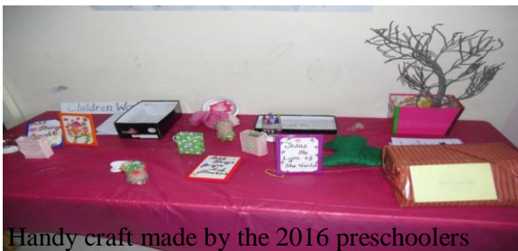
Handy craft made by the 2016 preschoolers

The children of St. Benedict Home also attended the summer camp of St. Benedict Parish. They particularly focused on music.