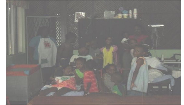
The St. Benedict Children's Home residents

In recent times (2011 - 2016) Our admission grew in a flash, within one week we admitted six (6) children in dire need of care (2 brothers each of two different families), one brother, one sister. This has pushed the number up to 20 children. To date the number remains high at 18 children