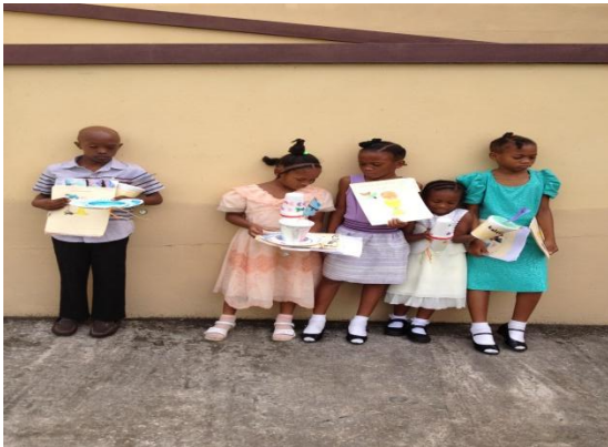
St. Benedict Parish Campers

The children of St. Benedict Home also attended the summer camp of St. Benedict Parish. They particularly focused on music.