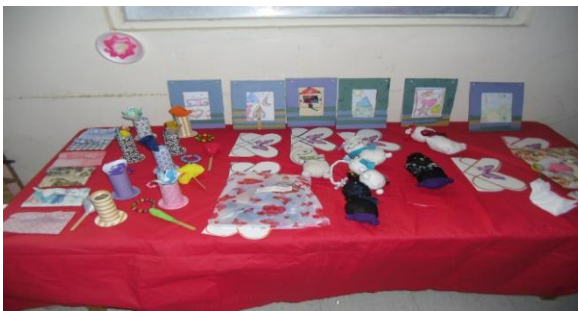
Handy craft made by the Summer Campers

CONGRATULATIONS my dear children on your achievements of preschool education and the summer campers